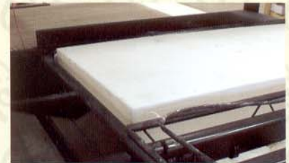
Large capacity, in-frame holding tanks for long trips and stays.