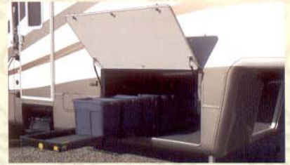
Large 115 cu./ft. storage compartment with slider bins.