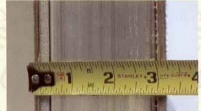
3-1/4" thick sidewalls with R-13 insulation and high strength.